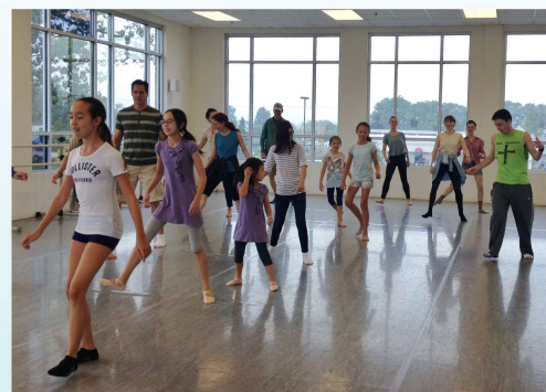
Our first line dancing lesson

Registration is open at www.cmballet.org . We hope to see you there!